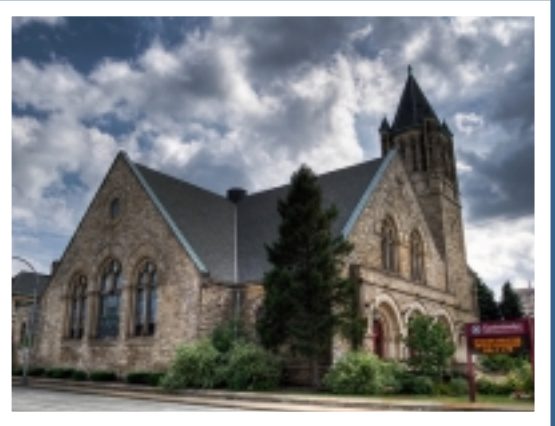
Eastminster Presbyterian Church

And while we are pilgrims on earth, we are demonstrating God's love in very tangible ways. We serve because we love our patients and we desire to bring to them wholeness of life in body, mind and spirit. Every day at the Center, we desire to please God. In each and every one of our 7,600 patients, we see the dignity and worth of God.