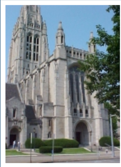
East Liberty Presbyterian Church

On our website at elfhcc.com , churches can find a complete proposal that can be downloaded and submitted to their leaders for possible funding.